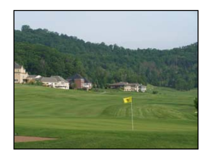
Table 8.1 and Map 8.1 on the following pages inventories and shows the location of the Town's natural, cultural and recreation resources.

There are no county operated public parks in the Town.